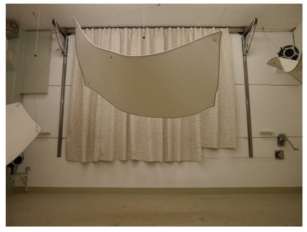
Fabric art.-no. 10935, Zimmer + Rohde GmbH