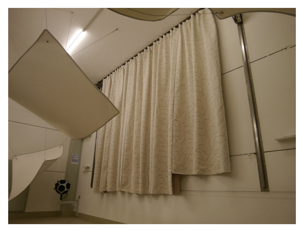
Figure B.2. Test object mounted in the reverberation room, diagonal view.